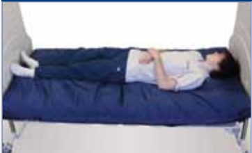
EASY TO SET UP WHEN MORE OR LESS IMMERSION IS REQUIRED