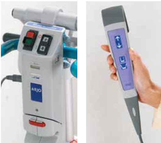
Dual controls. Handset or mast panel control? The carer can choose the most convenient control according to the situation.