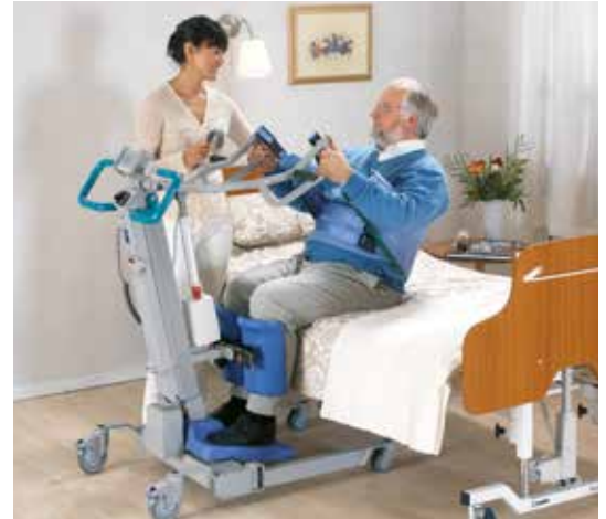
Using SARA 3000, a single carer can raise the resident into a standing position, comfortably and securely.

SARA 3000 makes carers' work easier. It enables safe transfers to be carried out by a single carer, because it completely eliminates manual lifting. The machine raises the resident to a standing position while providing optimum upper body support. Ergonomic design makes SARA 3000 simple and comfortable to operate and control. Easy operation via the handset or mast panel supports safe, efficient transfers, which means the carer can devote more attention to encouraging the resident's active participation in the transfer routine.