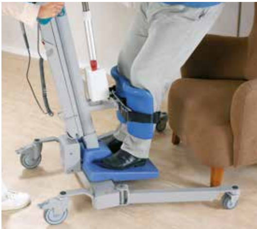
The powered chassis opens to provide optimum access for transfers. A wheel-lock mechanism secures the machine during raising and standing routines.