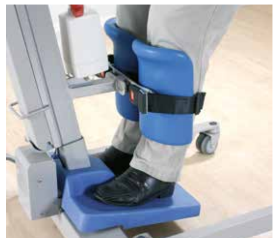
The footplate provides optimum safety and stability, while the kneepad allows natural flexion of the ankle.