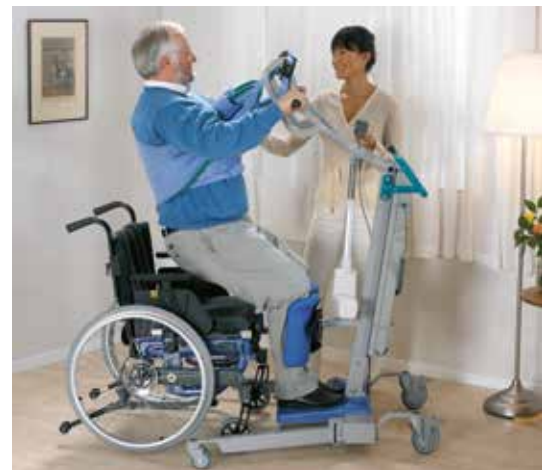
Transfer to a wheelchair is performed smoothly and under close control.