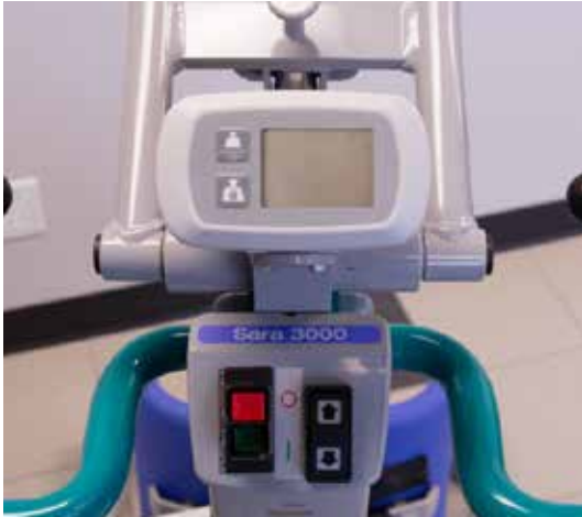
The optional integrated scale saves time by weighing the resident during a transfer.