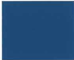
Deep Blue Ice