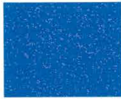
Ocean Blue Metallic