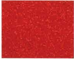
Salsa Red Metallic