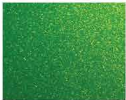
Acid Green Metallic